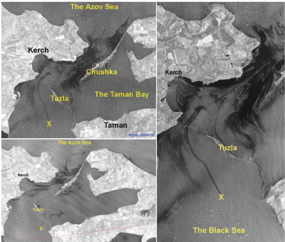
Fig. 6.4.1. Satellite SAR imaging of the Kerch Strait on 16.11.2007, i. e., five days after the catastrophe. Location of the Volgoneft-139 tanker bow part is marked with a cross.